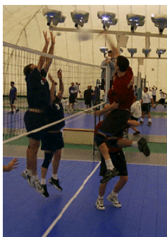
Carolina Region is FUN!