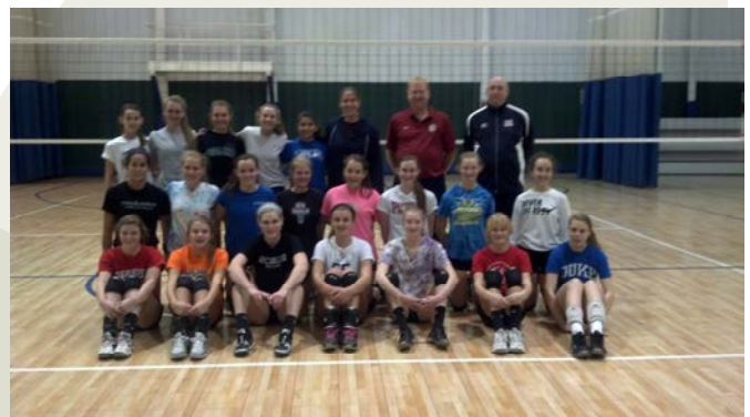
December, 2013 HP Clinic Attendees

http://www.teamusa.org/USA-Volleyball/High-Performance/HP-Indoor